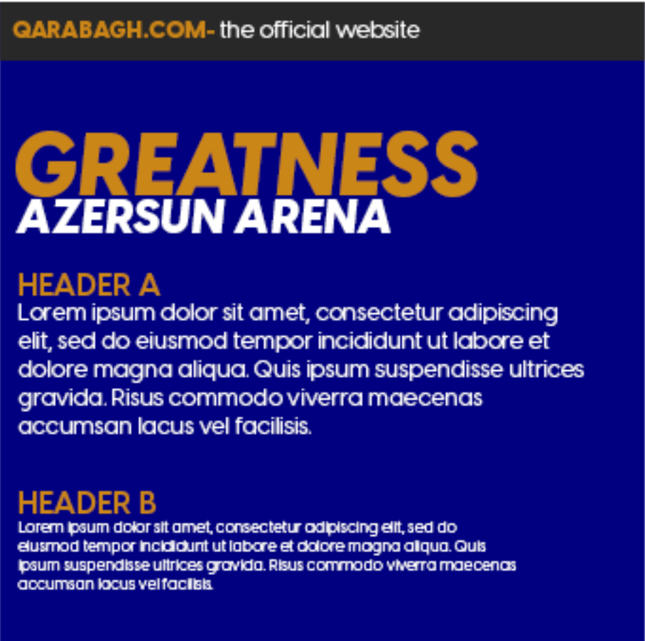
Usage on black background

Our brand identity can be achieved by using the three core colours. Our preferred background colours are black or white. Although imagery can also be used as a full bleed background