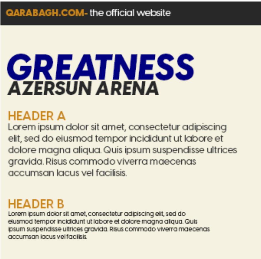
Usage on White background